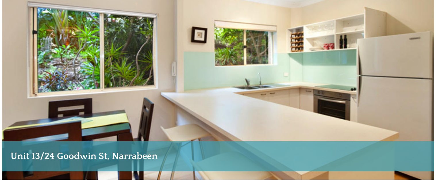
Unit 13/24 Goodwin St, Narrabeen