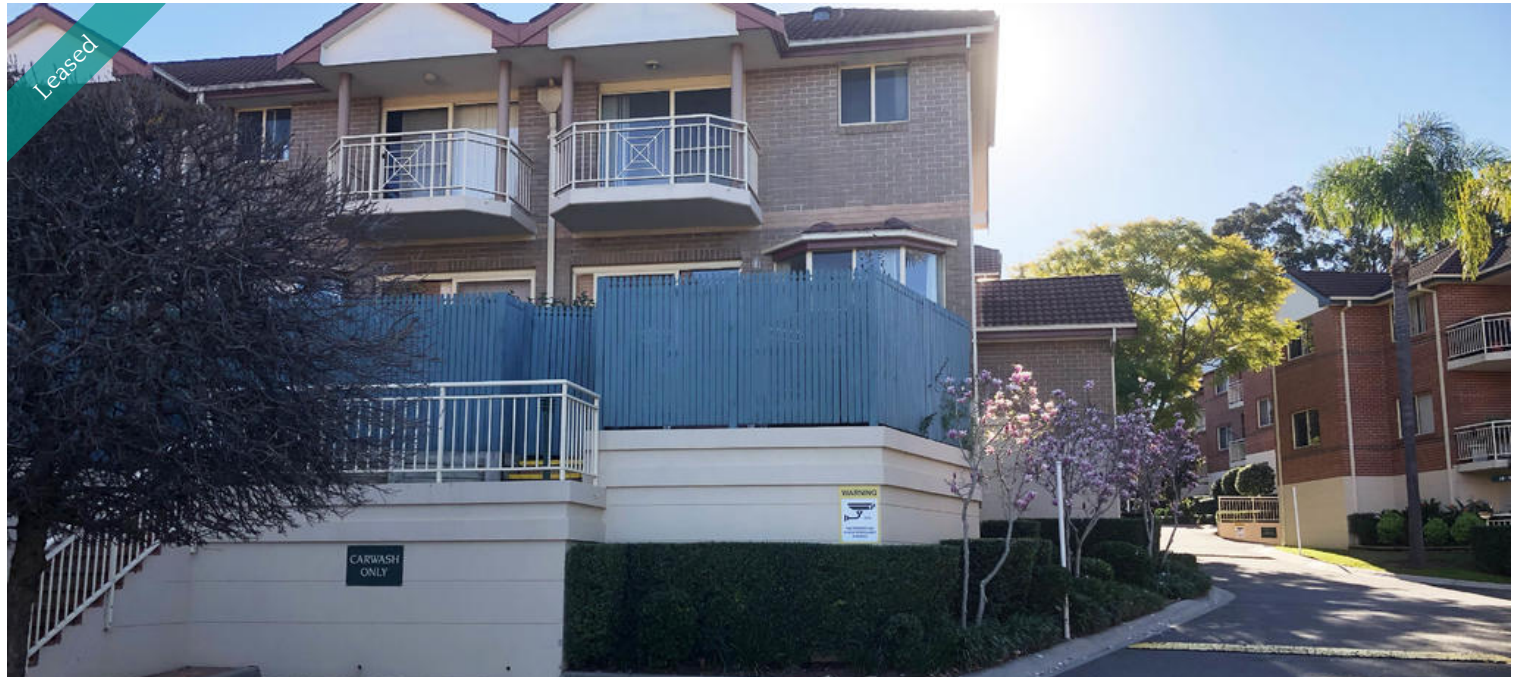
Unit 13/94-116 Culloden Rd, Marsfield